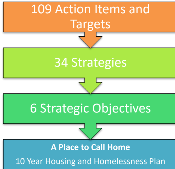
Figure 1.0 – Breakdown of 10 Year Plan Actions

It should also be noted that the implementation of many of the strategies in the 10-Year Housing and Homelessness Plan require partnerships and the involvement of other agencies, service providers, etc. Additionally, the plan's strategies range in complexity and resource requirements, from relatively simple strategies that can be carried out in the first couple of years with few resources, to complex ones that will take much longer and require extensive resources.